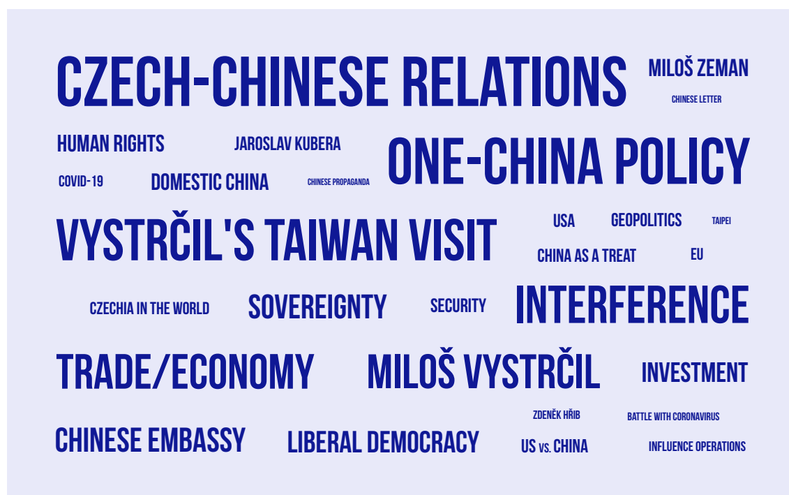
IMAGE 5: REPRESENTATION OF KEY TOPICS CONNECTED TO TAIWAN IN ANALYZED ALTERNATIVE CZECH MEDIA OUTLETS (2019–6/2021)

Parlamentní listy focused on domestic-driven agenda connected to the Czech political debate about Taiwan. The alternative media outlet published a number of critical texts on China (31), which were complemented by comments with a positive sentiment (26). Unsurprisingly, most of the latter quoted Chinese individuals and institutions (such as the Chinese Embassy in Prague, ministries of defense, foreign affairs, etc.). The site hosted a large amount of reprinted content (176) as well as com-