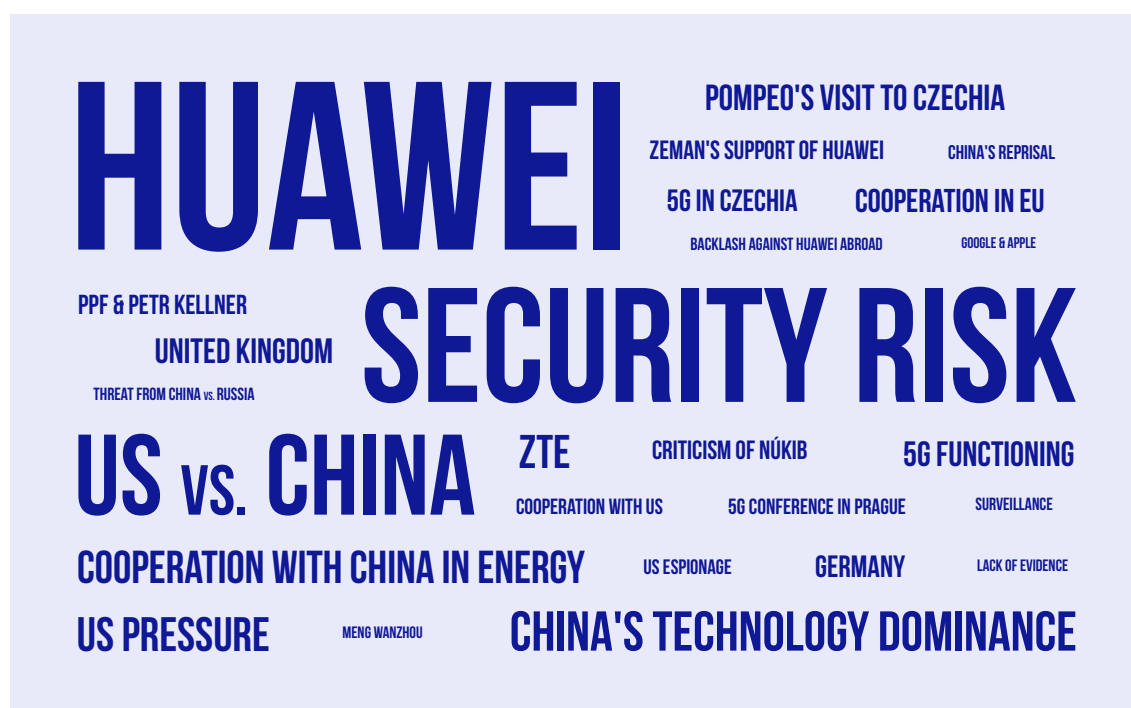
IMAGE 1: REPRESENTATION OF KEY TOPICS CONNECTED TO 5G ISSUE AND CHINA IN ANALYZED ALTERNATIVE CZECH MEDIA OUTLETS (2019–6/2021)

in 2019–2020. Instead, these media often chose to omit the contextual background and offered a reduced perspective of the Huawei issue, portraying it as part of the trade war between China and the US. 29 Such an oversimplification then left the reasoning leading to the adoption of measures unexplained, contributing to distorted impressions among readers.