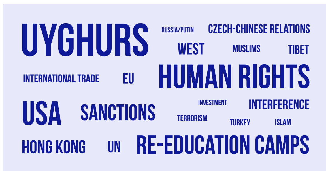
IMAGE 4: REPRESENTATION OF KEY TOPICS CONNECTED TO XINJIANG IN ANALYZED ALTERNATIVE CZECH MEDIA OUTLETS (2019–6/2021)

Due to an insufficient number of Aeronet-published articles on the topic (only one article), it is not possible to draw any substantial conclusions beyond looking at the general nature of the contributions, which typically reflect conspiratorial nature, high level of mistrust towards the EU, NATO, and above all the US, as well as frequent references to anti-Semitism.