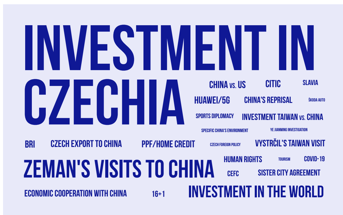
IMAGE 2: REPRESENTATION OF KEY TOPICS CONNECTED TO CHINESE INVESTMENT IN ANALYZED ALTERNATIVE CZECH MEDIA OUTLETS (2019–6/2021)

Chinese business practices. 77 This led to several mentions of the alleged uniqueness of the Czech Republic as being the “gate” for the strategic investment from China. 78 Interestingly, several articles provided space to traditional Chinese narratives of the peaceful nature of China 79 and one article emphasized the benefits of “cheap and high-quality Chinese products leading to lower costs for the Czech population.” 80 Nevertheless, these articles promoting Chinese investment were rather scarce, with the majority of articles focusing on factual information and news updates.