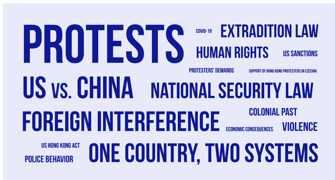
IMAGE 3: REPRESENTATION OF KEY TOPICS CONNECTED TO HONG KONG IN ANALYZED ALTERNATIVE CZECH MEDIA OUTLETS (2019–6/2021)

Related to the notion of interference in the internal Chinese affairs are the attempts to portray the US (and sometimes also other Western countries) as instigators of the protests, 109 sometimes even naming specific organizations, such as the Human Rights Watch (HRW) or National Endowment for Democracy (NED).