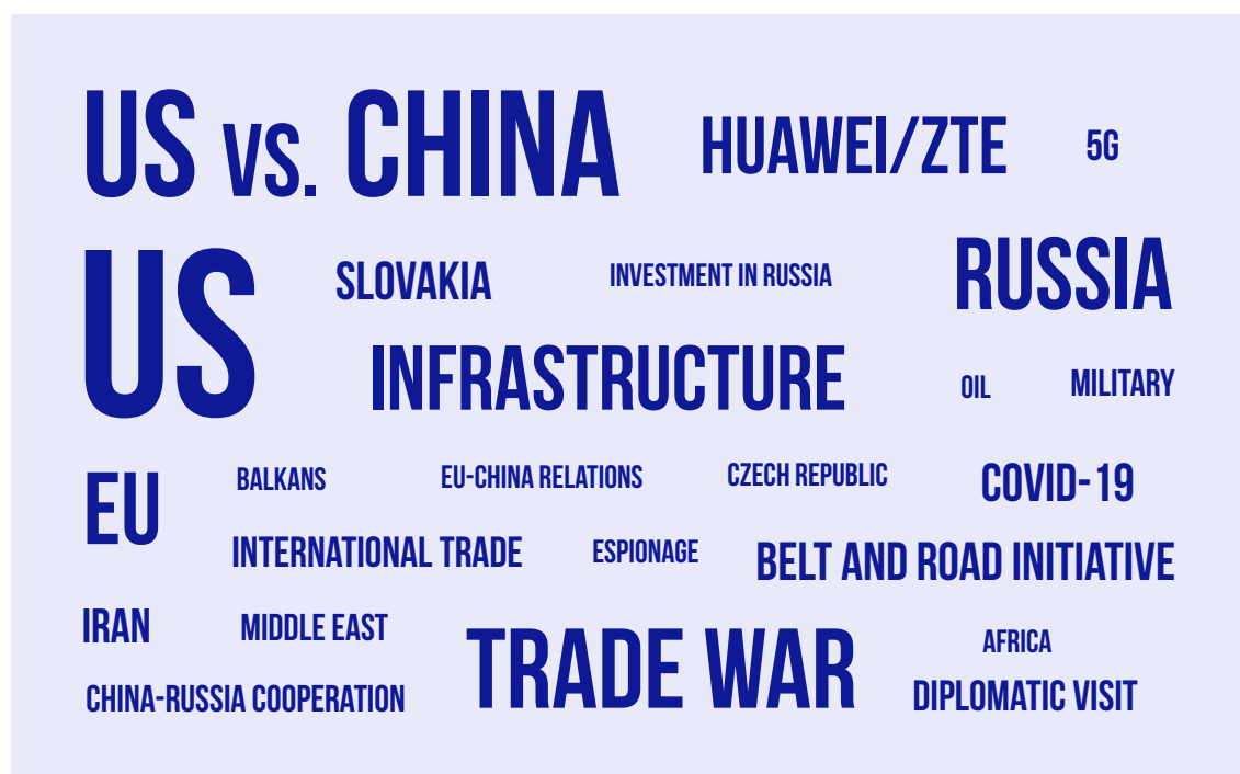
IMAGE 7: REPRESENTATION OF KEY TOPICS CONNECTED TO CHINESE INVESTMENT IN ANALYZED ALTERNATIVE SLOVAK MEDIA OUTLETS (2019–6/2021)

In July 2019, a meeting between President Zuzana Čaputová and Chinese Minister of Foreign Affairs Wang Yi took place in Bratislava. During the meeting, President Čaputová raised the issue of human rights violations in China. As a result, the president faced intense backlash from the then pro-China government, as well as the ‘alternative media’ scene in Slovakia. Hlavné správy published an editorial attacking President Čaputová who purportedly “weakens the international position of Slovakia” as “the current approaches and speeches of President Čaputová are endangering