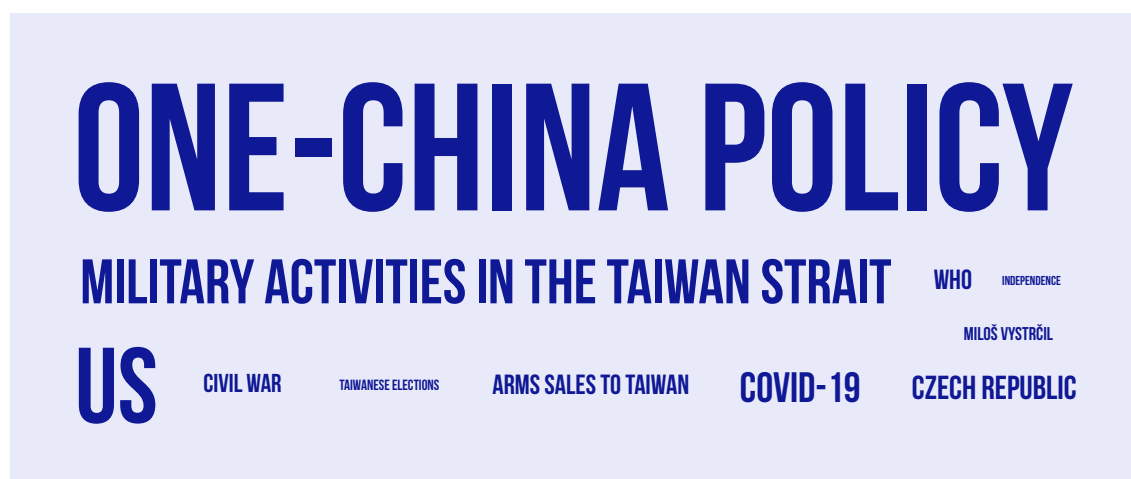
IMAGE 10: REPRESENTATION OF KEY TOPICS CONNECTED TO TAIWAN IN ANALYZED ALTERNATIVE SLOVAK MEDIA OUTLETS (2019–6/2021)

Interestingly, articles discussing China and Taiwan portrayed China almost exclusively in a negative light. This was especially prominent in the articles discussing Taiwanese mask donations, which included quotes from some of the loudest critics of China that can be found in Slovakia. To illustrate, Hlavné správy, in one of their original articles, quoted Peter Osuský, Deputy-Chair of the Foreign Affairs Committee of the Slovak National Council, saying that mask donations from Taiwan were granted “thanks to R.L. Tseng, who is the Ambassador of Taiwan, even though he cannot be titled as such due to the unacceptable pressure of the red comrades from Beijing.” 202