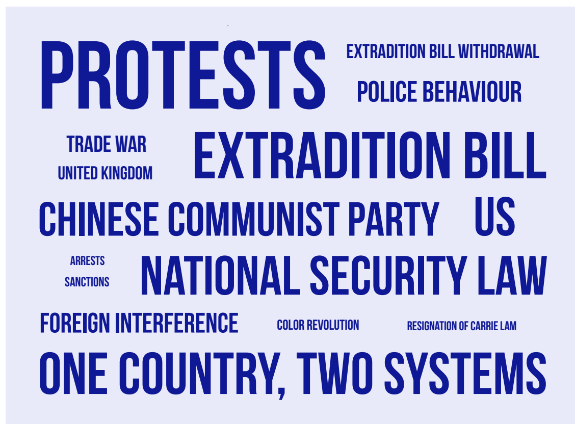
IMAGE 8: REPRESENTATION OF KEY TOPICS CONNECTED TO HONG KONG IN ANALYZED ALTERNATIVE SLOVAK MEDIA OUTLETS (2019–6/2021)

Expectedly Carrie Lam, the Chief Executive of Hong Kong, was one of the most frequently mentioned actors. Specifically, she was mentioned in 58 articles, which represents 19 percent of all analyzed content. Carrie Lam, so to speak, personified the official position of Beijing which was continuously built on arguments of the sovereignty of the territory of China, of which Hong Kong is necessarily a part.