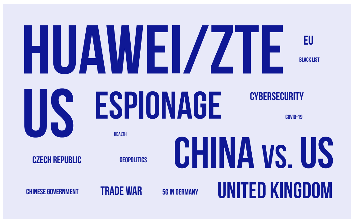
IMAGE 6: REPRESENTATION OF KEY TOPICS CONNECTED TO 5G ISSUE AND CHINA IN ANALYZED ALTERNATIVE SLOVAK MEDIA OUTLETS (2019–6/2021)